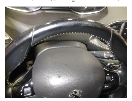
1. FRONT: Steering wheel - condition