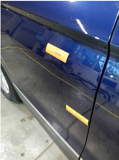
image / scratches