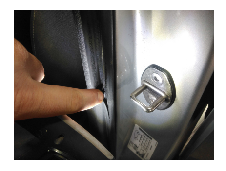
2. INSIDE: Trims - condition