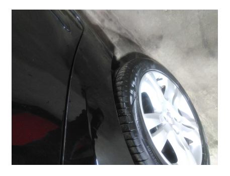
6. SIDE: Wheels - condition