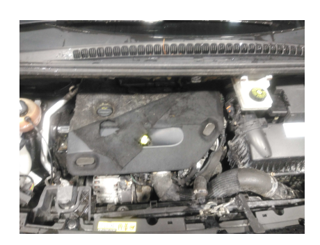
2. FRONT: Hood sound insulation for condition