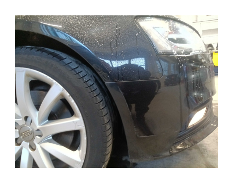
3. FRONT: Hood - visual damage