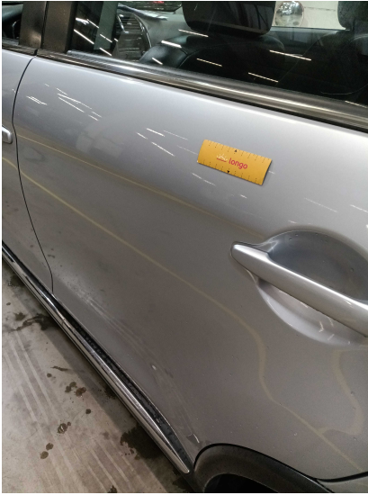
6. SIDE: Left and right side - visual damage / scratches