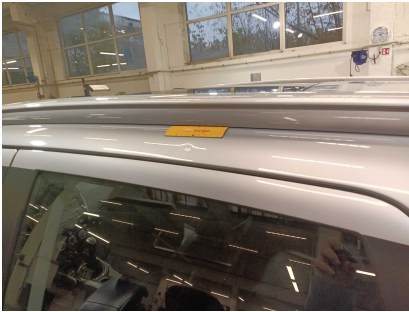
7. SIDE: Left and right side - visual damage / scratches