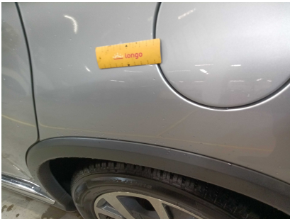
8. SIDE: Wheels - condition