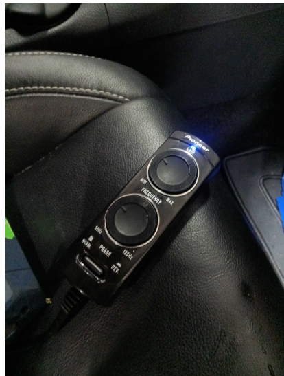
to system - operation