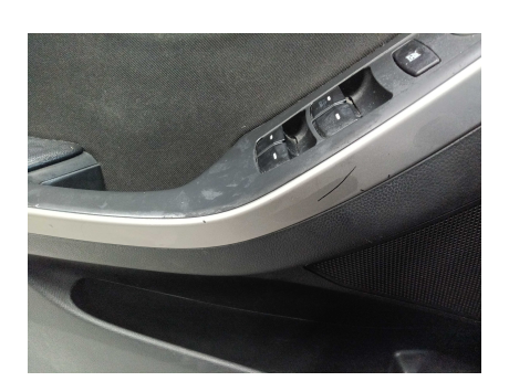
4. DOORS: Door rubber