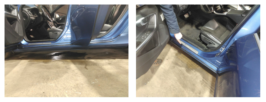
2. FRONT: Trims - condition