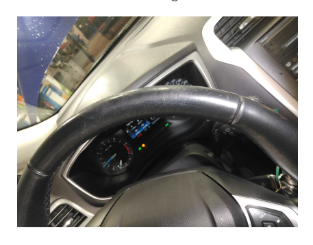
2. INSIDE: Trims - condition