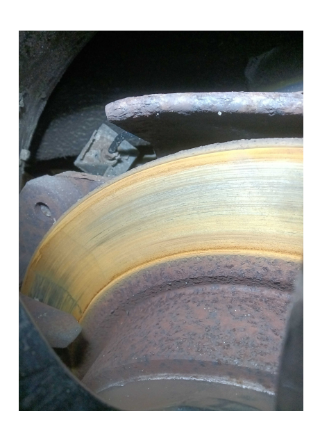
3. BRAKES: Front brake disc (both)