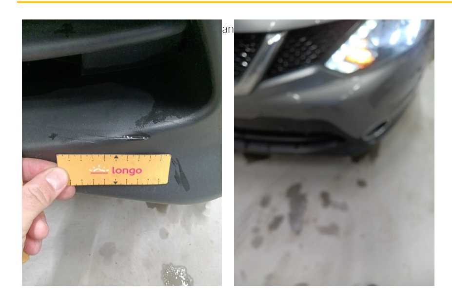
2. FRONT: Hood - visual damage