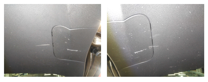
2. DOORS: Trims - condition