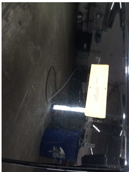
image / scratches