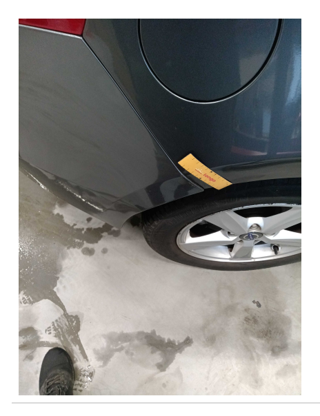
4. REAR: Trunk - visual damage