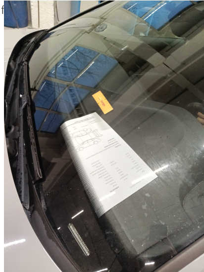
Vehicle from MOT test