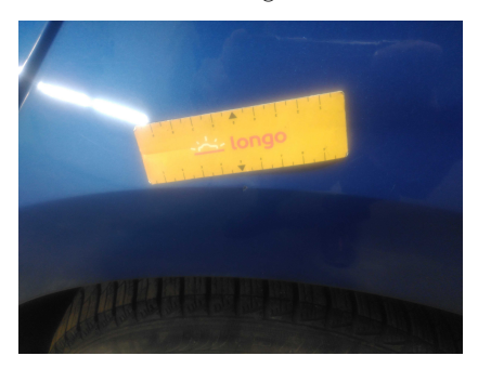
1. SIDE: Left and right side - visual damage / scratches