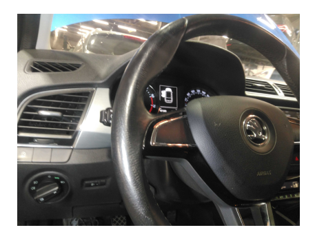
1. FRONT: Steering wheel - condition