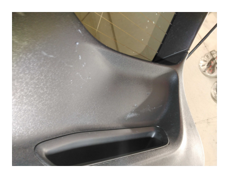
2. DOORS: Door rubber