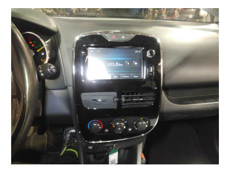
2. FRONT: Steering wheel - condition