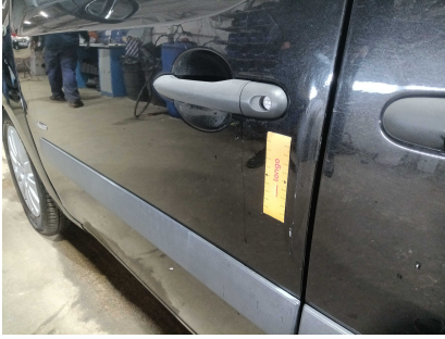
2. SIDE: Left and right side - visual damage / scratches