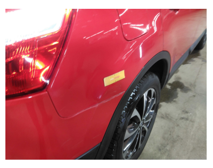
4. SIDE: Left and right side - visual damage / scratches