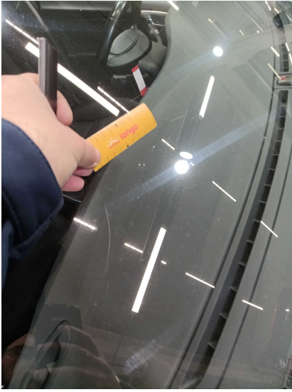
2. SIDE: Left and right side - visual damage / scratches