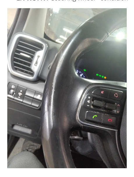
1. FRONT: Steering wheel - condition