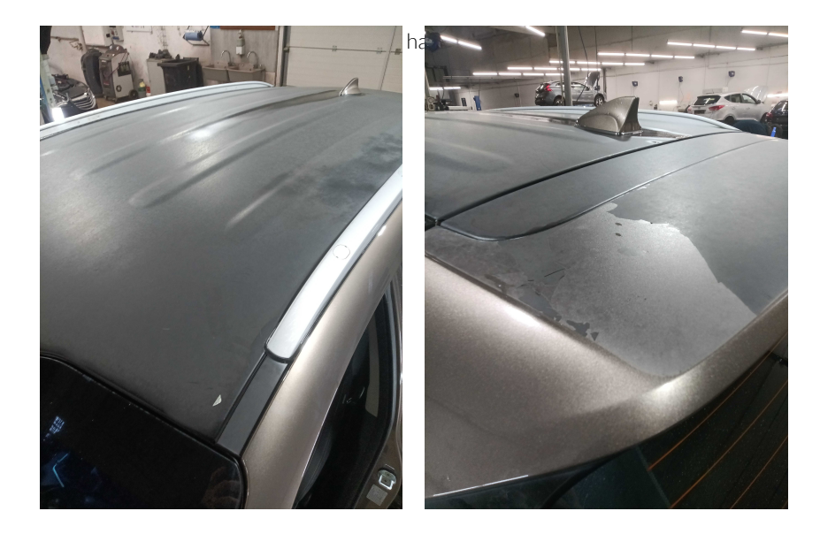
2. SIDE: Left and right side - visual damage / scratches