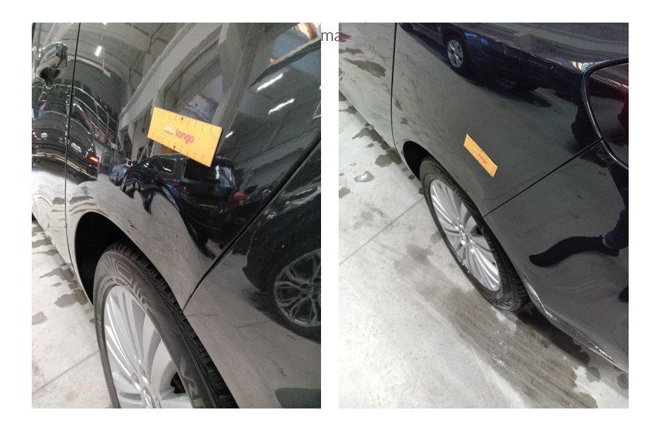
5. SIDE: Left and right side - visual damage / scratches